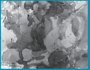
Pitcher and Fruit, Judith Mehring

Please take proper precautions in suspending or supporting your work. Artwork intended to be framed must be securely framed and wired and ready for hanging. Two-dimensional work not intended to be framed must also be ready to hang. Clamped glass as a method of framing is not acceptable. Sculpture and threedimensional entries must be accompanied by a sturdy, stable pedestal.